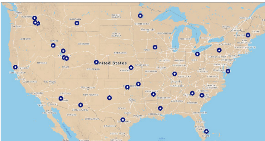
Figure 1. Map. Geographical location of forensic investigation sites. 1

The forensic pooled fund study provided important benefits to the participating DOTs, including understanding the factors that produce good or poor performing pavements and how LTPP data